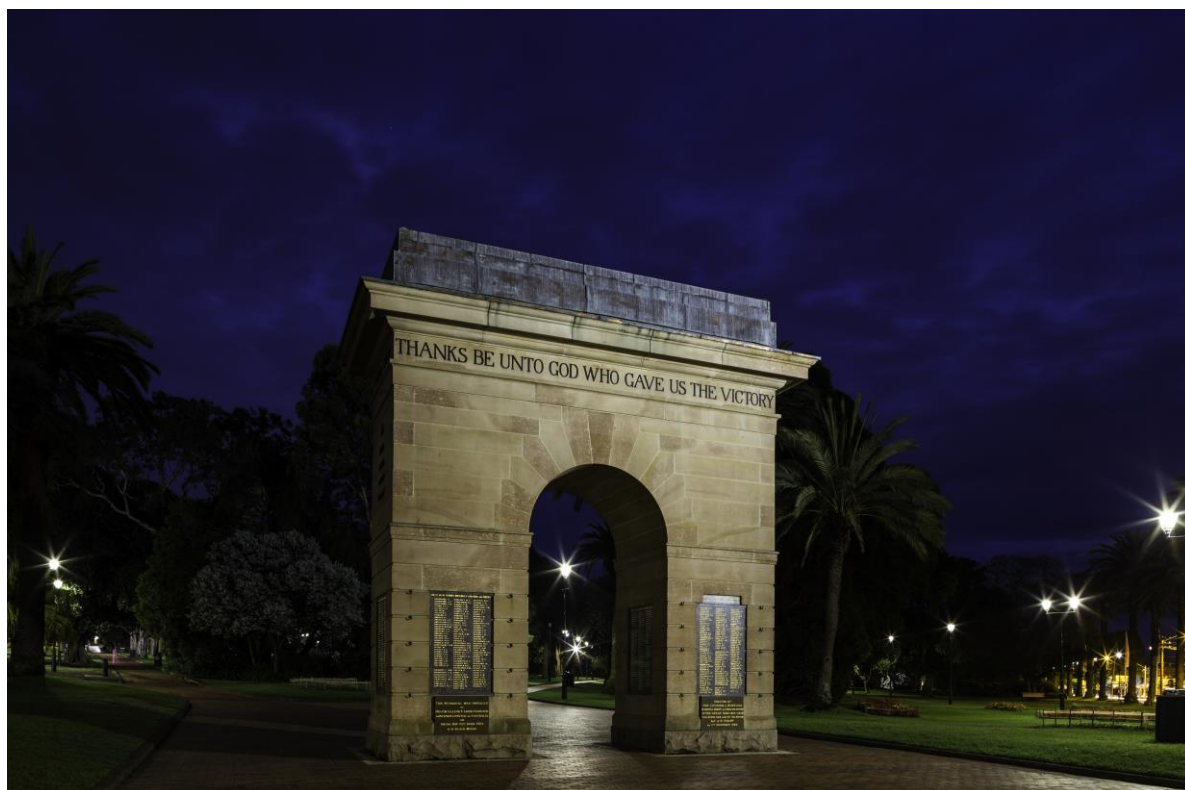
Burwood War Memorial Arch